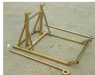
C-825-06 Grounding Frame