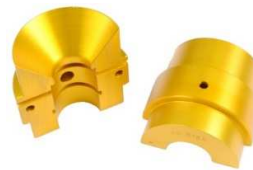
B) Duct Seal Collet