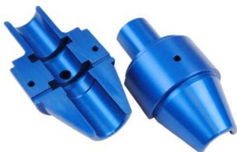
C) Cable Collet Assembly & D) In-Feed Cable Collet